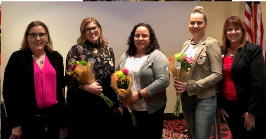
January Chapter Meeting