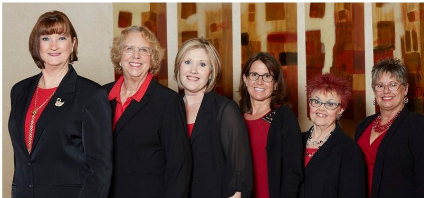
District Vice Presidents from left to right