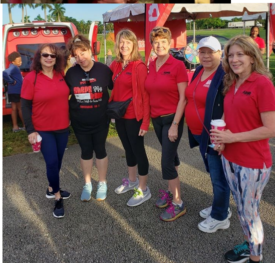
Walking in support of the SOS Children's Village November 16, 2019