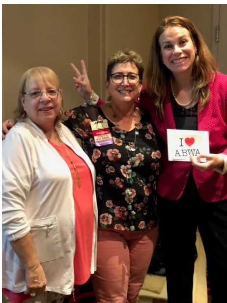
November Chapter Meeting