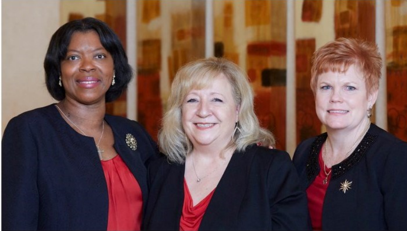
National Officers from left to right