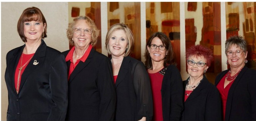
District Vice Presidents from left to right