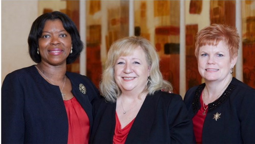
National Officers from left to right