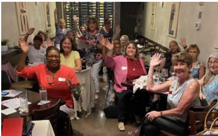
July meeting at Sette Mezzo Ristorante after a wonderful Italian feast followed by Community Connections and networking!