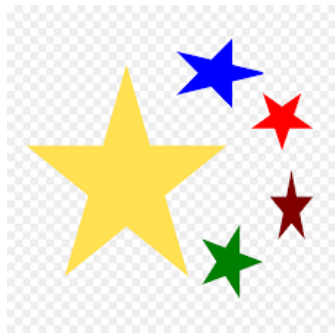
February's Super Star

Our 2023 Top Ten Nominee is....Gayle Bramson!