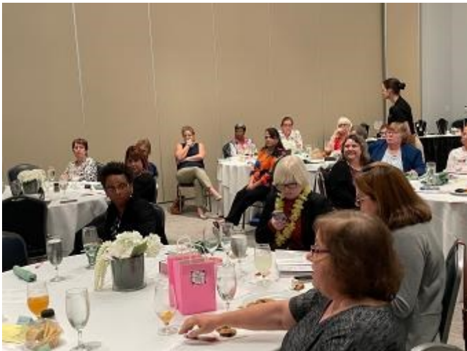
Great attendance at the March meeting—back upstairs in the ballroom!