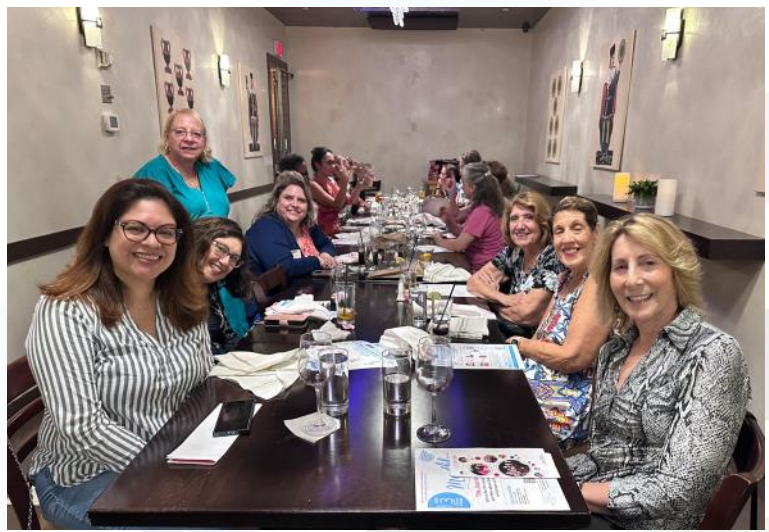
July Meeting at Sette Mezzo Restaurant