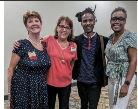
Making connections at August meeting