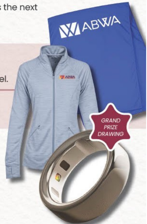
OURA 4 SMART RING VALUED AT $349

When submitting a referral form online, your referral contact will be notified by email that you referred her name for membership in the American Business Women's Association. A member of the National Headquarters Team will email your friend or colleague to inform her about membership opportunities available in ABWA. The rest is up to her!